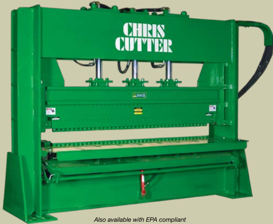
Also available with EPA compliant Diesel Power Unit